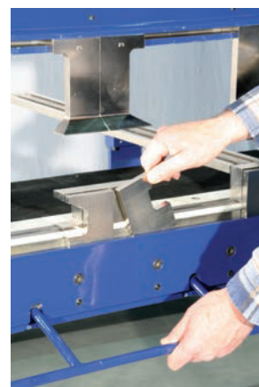
Patented eccentric fast clamping for the clamping and folding beams