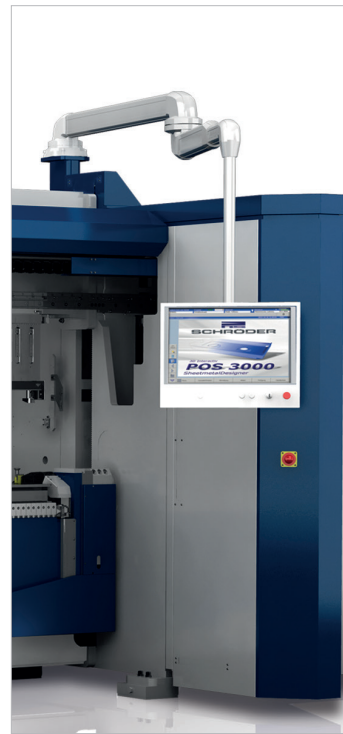
Software control of a folding machine